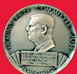
DEMING PRIZE 2003