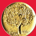
JAPAN QUALITY MEDAL 2007